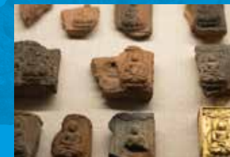
Artifacts of Yamadadera Temple