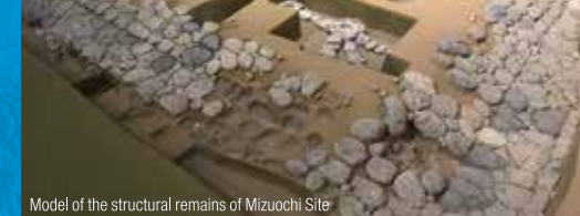
Model of the structural remains of Mizuochi Site