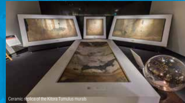
Ceramic replica of the Kitora Tumulus murals