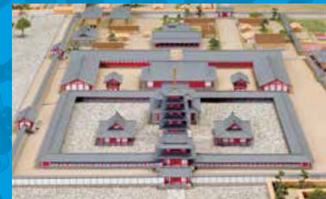
The pagoda of Asukadera Temple (Part of the miniature of ancient Asuka)