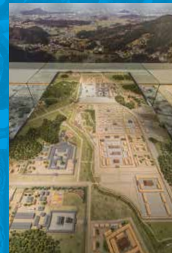
Miniature of ancient Asuka