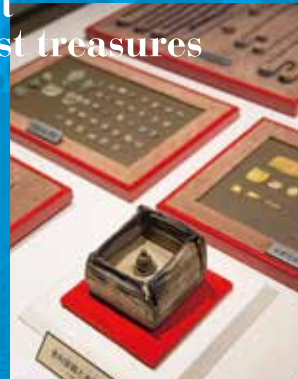
Reliquary from the pagoda of Asukadera Temple