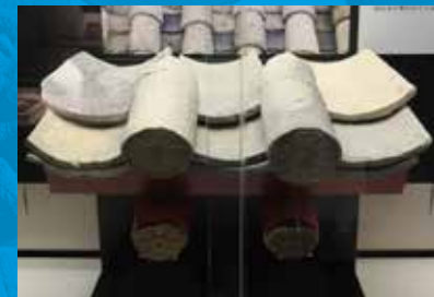
Tiles of Asukadera Temple