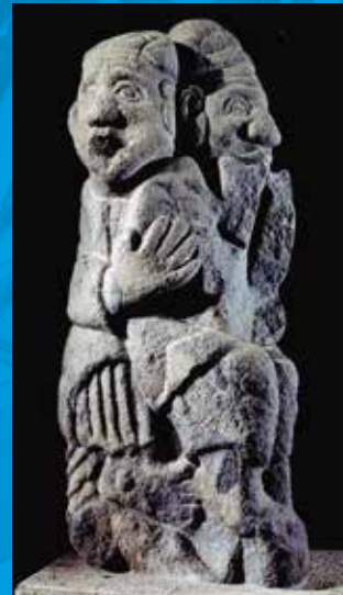
Humanoid Stone Sculpture unearthed at the Ikaruga Site