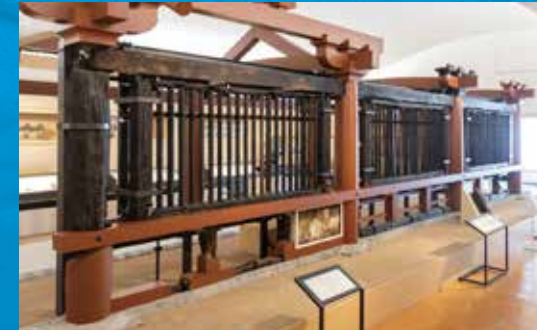
The eastern corridor of Yamadadera Temple

The oldest material revealing ancient temple construction. See the actual remains of the eastern corridor documenting the majesty of ancient Asuka. These wooden remains are even older than Hōryūji Temple.