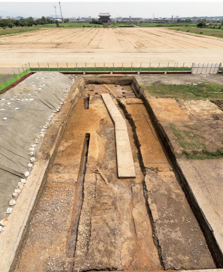
平城宮第一次大極殿院南門と内庭石敷（北から） South gate and stone paving of the Former Imperial Audience Hall Compound (from the north)