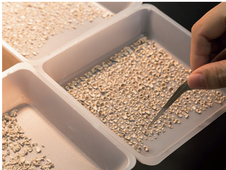
環境考古学研究室：台の下貝塚（宮城県）から出土した貝類の分析 Environmental Archaeology Section: Analysis of shell varieties recovered from the Dainoshita shell midden (Miyagi prefecture)