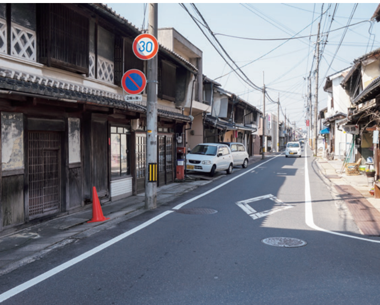
建造物研究室：津山市城西地区の町並 Architectural History Section: Townscape of Jōsai District, Tsuyama City