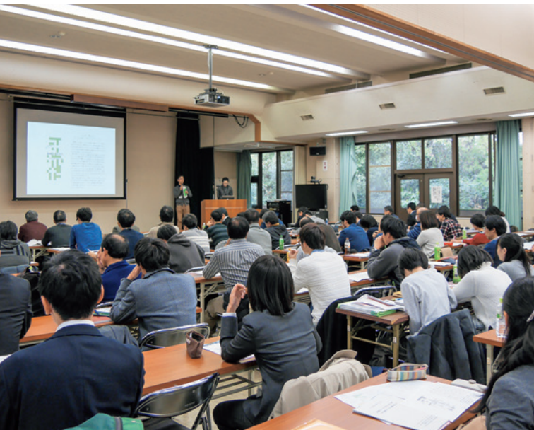
景観研究室：第9回文化的景観研究集会 Cultural Landscape Section: 9th Research Meeting on Cultural Landscapes