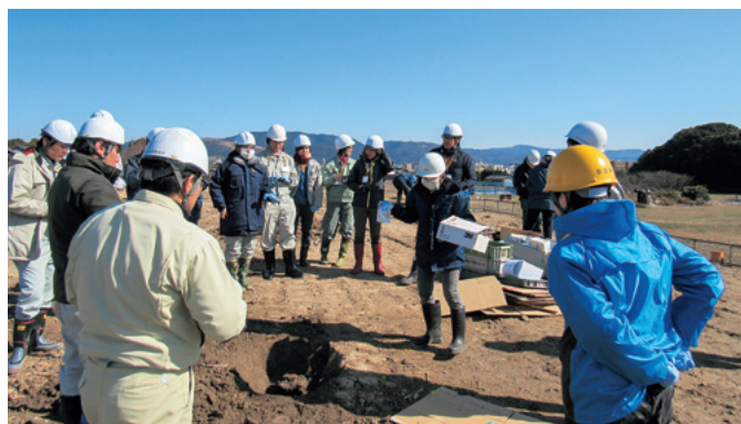
保存科学Ⅳ（遺構・石造文化財）課程「発掘現場における脆弱遺物の取り上げ実習」 Preservation Science IV (Features, Stone Structure Cultural Properties) Course, "Practical Training in the Removal of Fragile Artifacts from a Site"

The Photography Section is involved in the production, management, and development of new technology for photographs related to cultural properties.