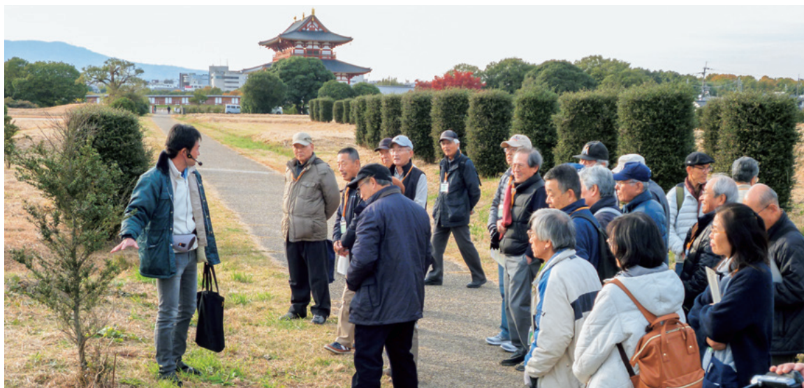
平城宮跡解説ボランティアの現地研修の様子 A view of on-site training for volunteers who provide explanations at the Nara palace site