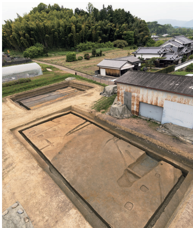
山田道の調査 左：池状遺構の底から古墳時代後半の土器、木製品が大量に出土した（南東から）、右：山田道南側溝や溝、池状遺構のほか、古墳時代の竪穴建物を検出した（北東から） Investigation of Yamadamichi. Left: Pottery and wooden implements of the latter half of the Kofun period are recovered in large amounts from the bottom of a pond-like feature (from the southeast). Right: In addition to the southern gutter of Yamadamichi, ditches, and pond-like features, pit structures of the Kofun period are detected (from the northeast)