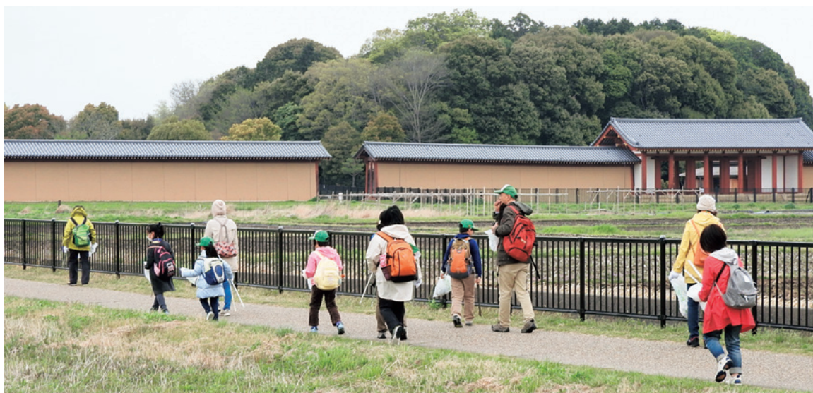
平城宮跡クリーン大会の様子 Nara Palace Site Clean Up Campaign