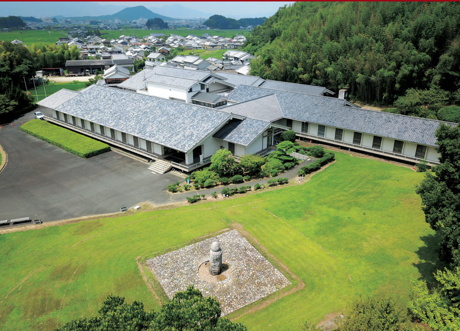
飛鳥資料館外観 View of Asuka Historical Museum