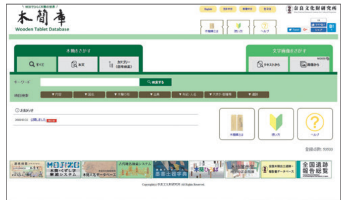
木簡庫トップページ Top page of the Mokkanko (Wooden Tablet Database)