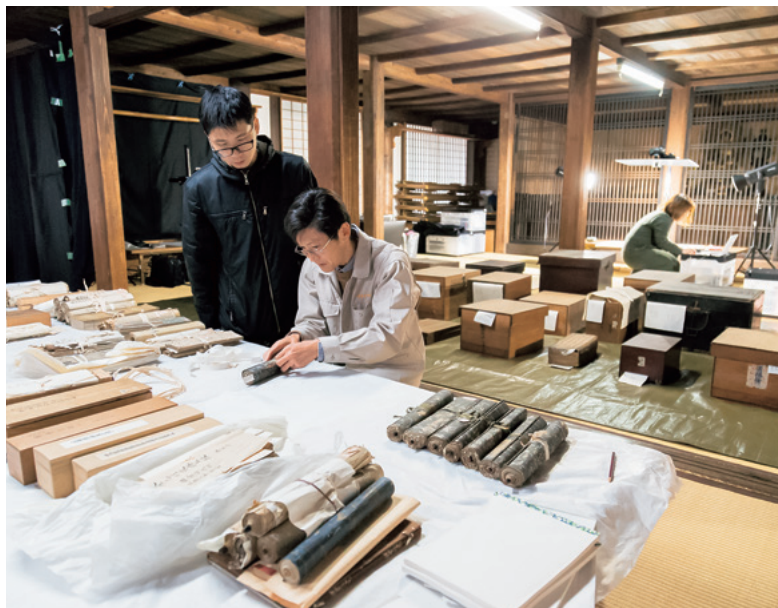
歴史研究室：唐招提寺の古文書調査 Historical Document Section: Investigation of ancient documents at Tōshōdaiji temple