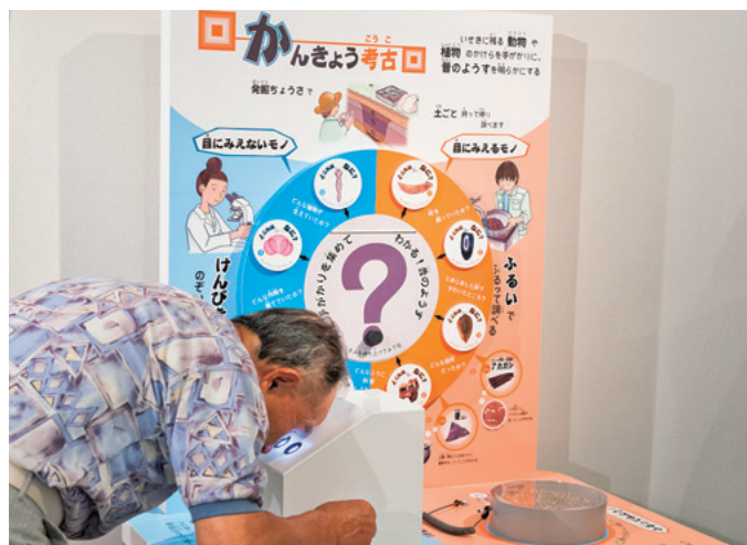
考古科学コーナー Archaeological Science Corner