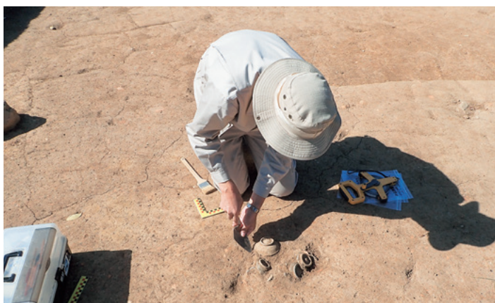
韓国慶州月城の発掘調査風景 View of excavation at Gyeongju Wolseong in South Korea