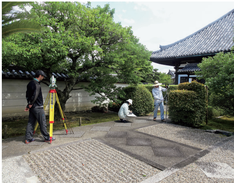
遺跡整備研究室：名勝法華寺庭園の実測調査 Sites Management Research Section: Mapping survey of the Hokkeji temple garden, a nationally designated Place of Scenic Beauty