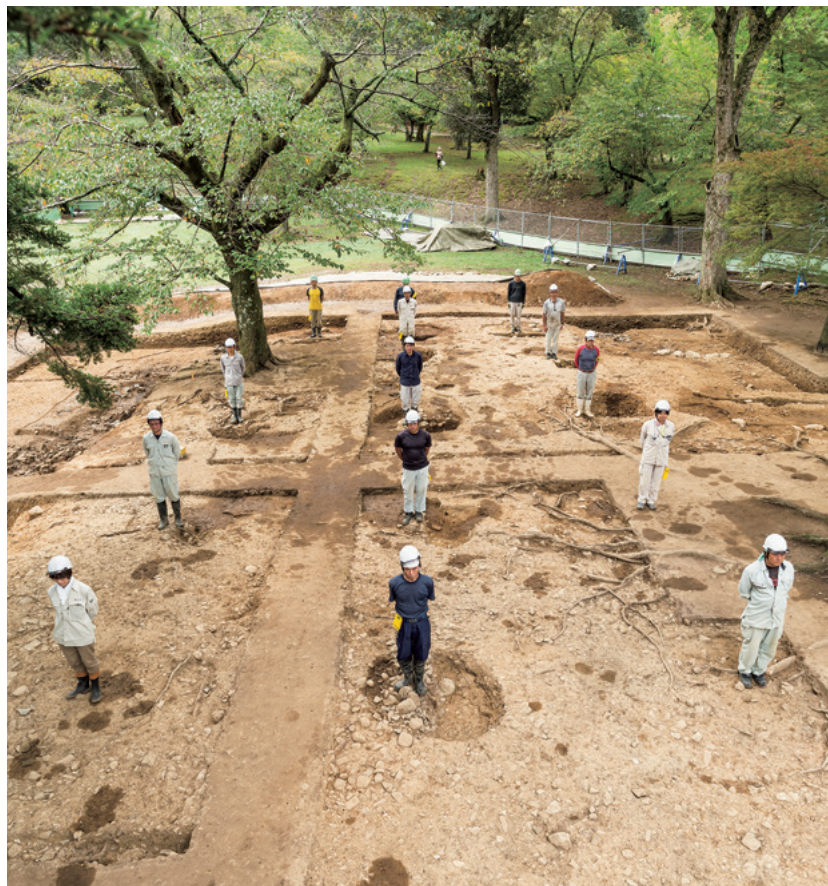
東大寺東塔院の鎌倉時代の南門と回廊（西から） South gate and cloister of the Kamakura period at the East Pagoda Compound of Tōdaiji temple (from the west)