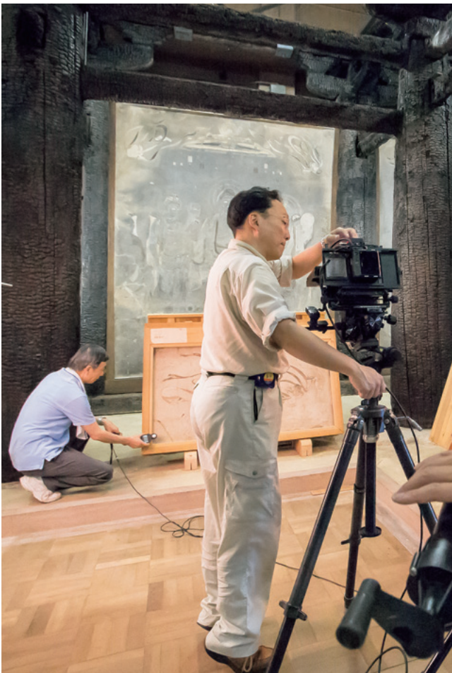
法隆寺金堂壁画のデジタルアーカイブ事業 Digital archive project for the murals of the Main Hall at Hōryūji temple