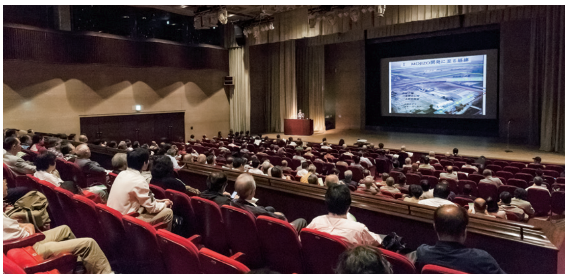
第9回東京講演会 9th Tokyo Public Lecture