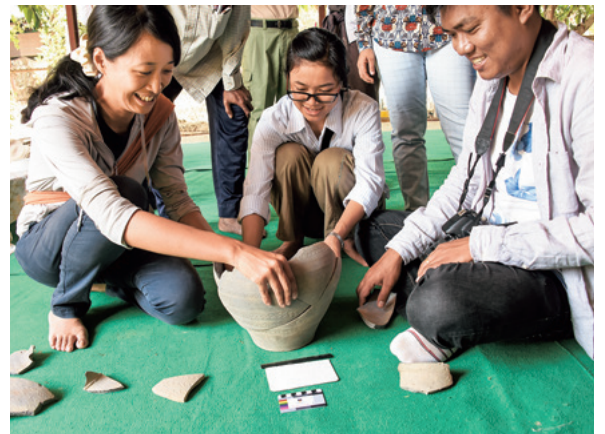
ミャンマーモン州での遺物調査法研修 Training in methods of investigating artifacts, in Mon State, Myanmar