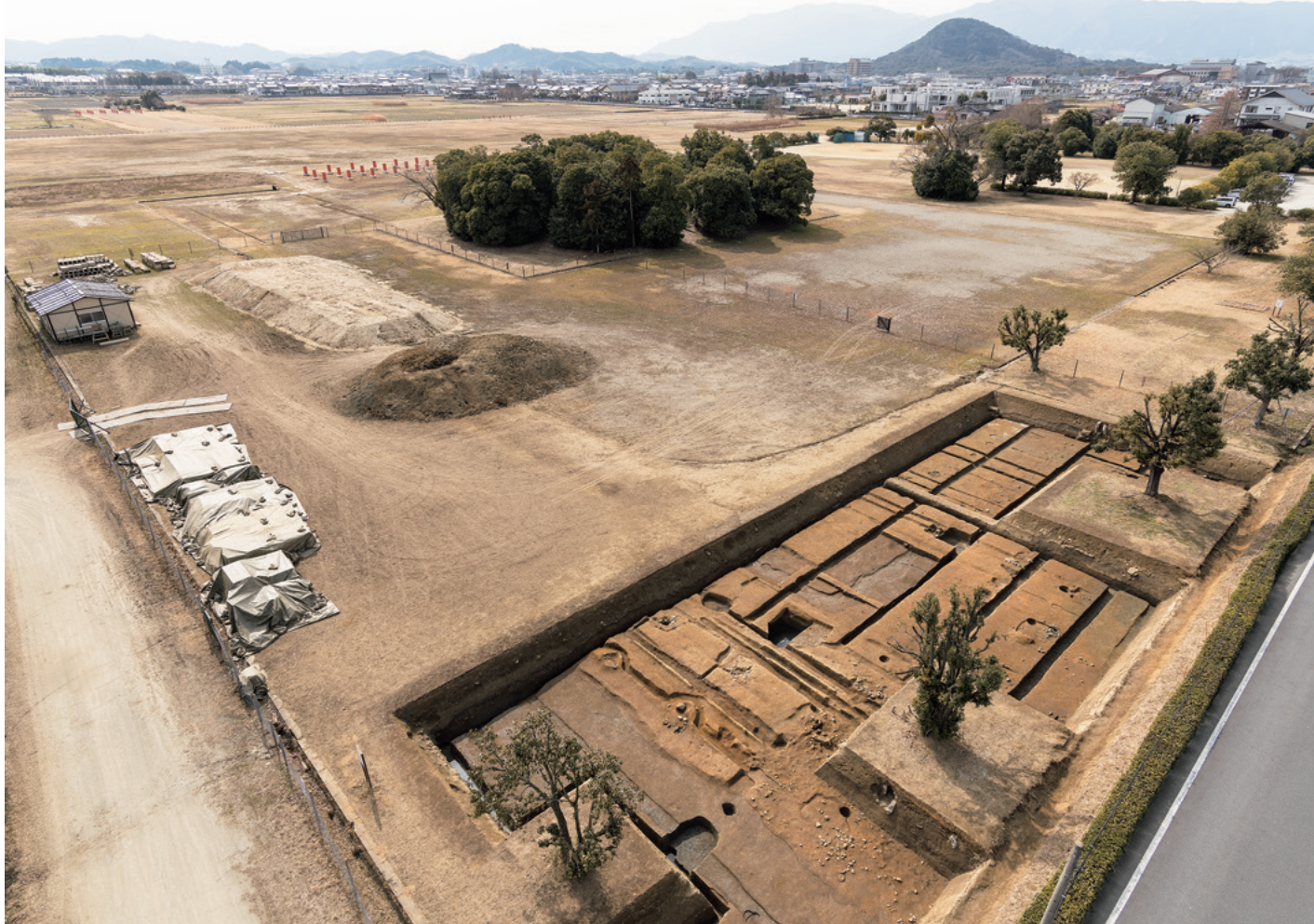
藤原宮大極殿院の調査 東面北回廊および北面東回廊の規模や構造があきらかとなった（北東から） Investigation of the Imperial Audience Hall Compound of the Fujiwara palace: The scale and structure of the east side's northern cloister and the north side's eastern cloister are clarified (from the northeast)