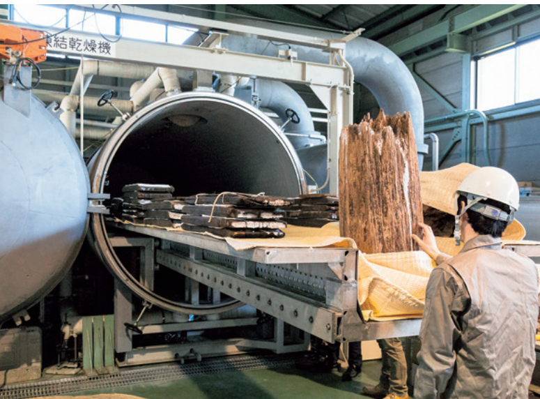
保存修復科学研究室：大型木製品の真空凍結乾燥処理 Conservation Science Section: Vacuum freeze-drying processing for large-scale wooden implements