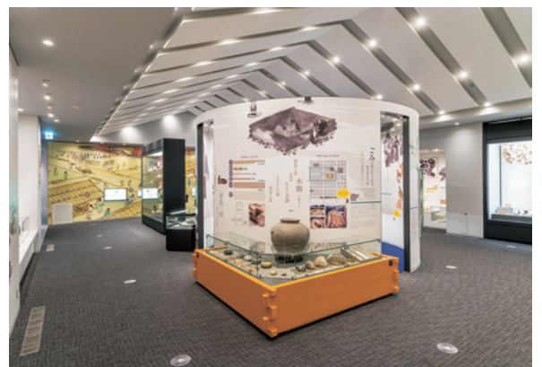
平城宮いざない館展示室4 (詳覧ゾーン) Exhibit Room 4, Heijokyu Izanai-kan Information Center (detailed viewing zone)