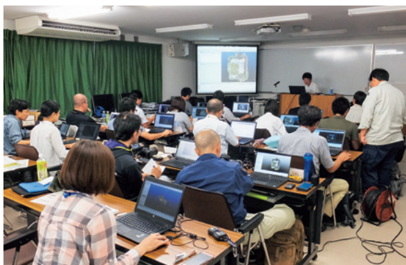
三次元計測課程「写真計測の遺構への利用」 3D Measurement Course, "Utilization for Photographic Measurement of Features"