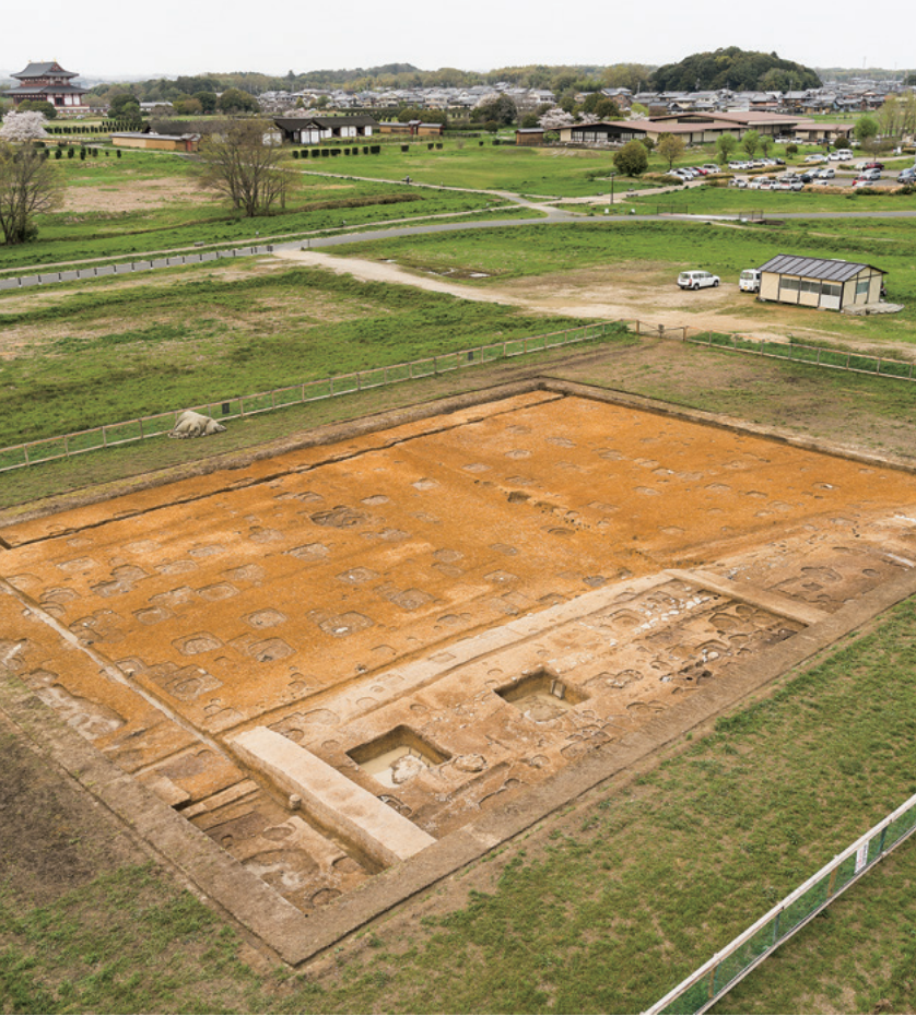
平城宮東院の複雑に重層する建物遺構（南東から） Complexly overlapping building features at the East Palace of the Nara palace (from the southeast)