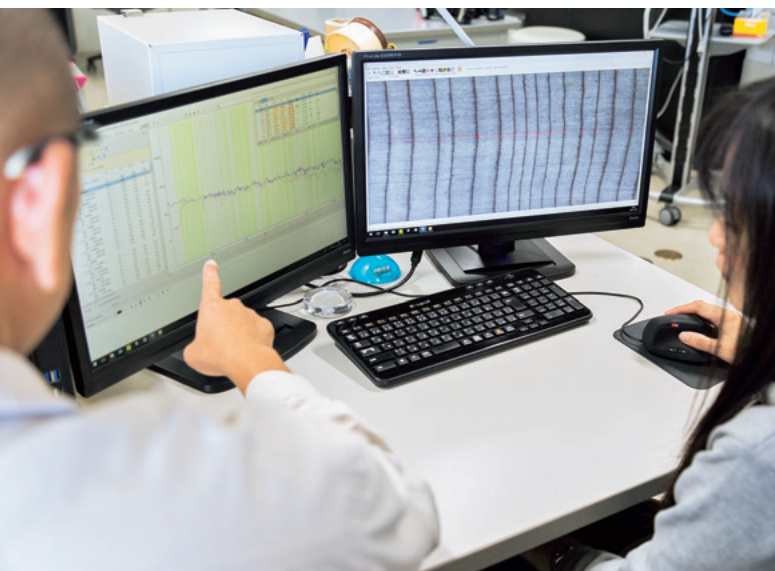
年代学研究室：年輪計測画像・年輪曲線検討風景 Dendrochronological Dating Section: Computer images of tree ring measurement and an examination of the master curve