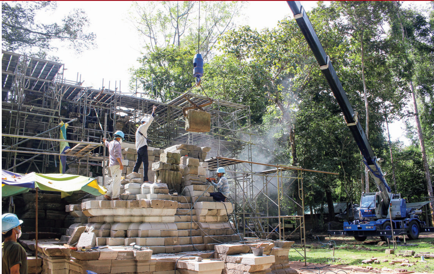
カンボジア西トップ遺跡北祠堂の修復事業 Restoration project for the Northern Shrine at Western Prasat Top, Cambodia