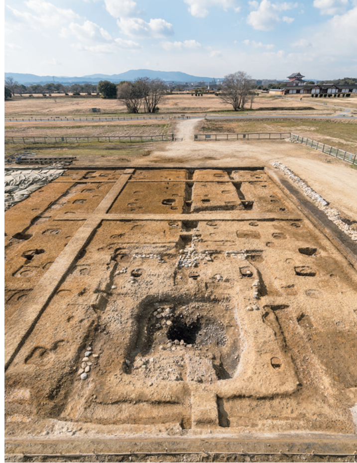
平城宮東院の大型井戸と覆屋をともなう溝（東から） Ditches accompanying a large-scale well and roof cover at the East Palace of the Nara palace (from the east)