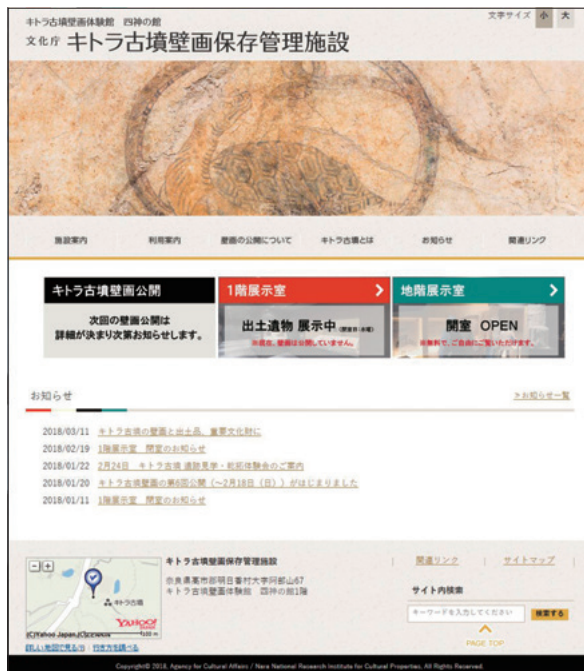
キトラ古墳壁画保存管理施設トップページ Top page of the Center for Preservation of Kitora Tumulus Mural Paintings

In addition to providing a variety of information about cultural properties, through 30 databases and other materials such as high definition digital images, efforts are being made at widely circulating the Institute's research results, through full access to a portion of its publications placed in a research information repository