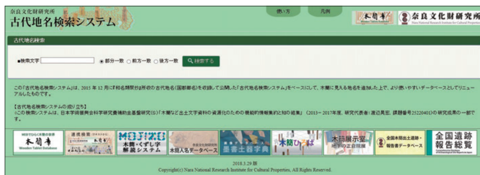
古代地名検索システム Top Page of the Ancient place name search system