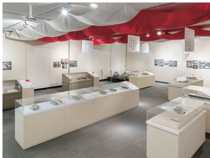
秋期特別展 地下の正倉院展—国宝 平城宮跡出土木簡— Autumn Special Exhibit, "A Subterranean Treasure House: The National Treasure 'Mokkan Excavated at the Heijō Palace'"