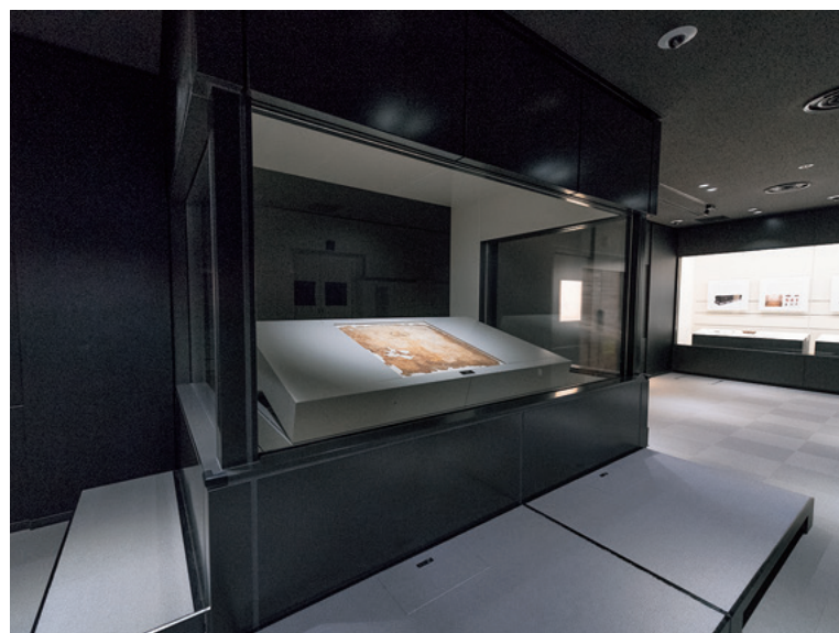
キトラ古墳壁画の公開（第5回） Venue of the exhibit "Mural Painting of the Kitora tumulus"