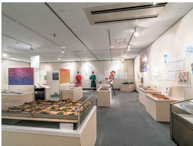
夏期企画展 ナント！すてきな!? 平城生活（ライフ）♪ Summer Planned Exhibition, "How Delightful!? Life at the Capital"