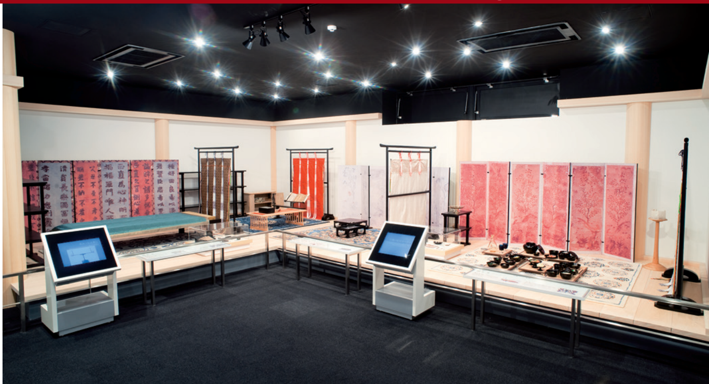
宮殿復原展示コーナー Palace Reconstruction Display Room