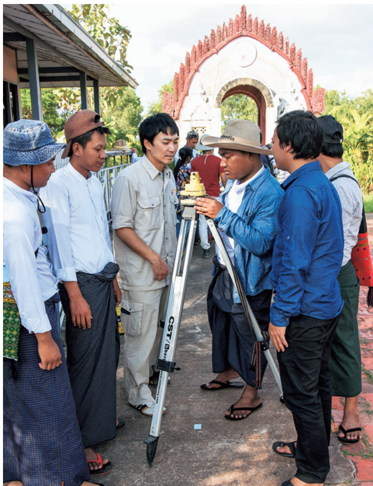
ミャンマーでの測量研修 Training in surveying held in Myanmar