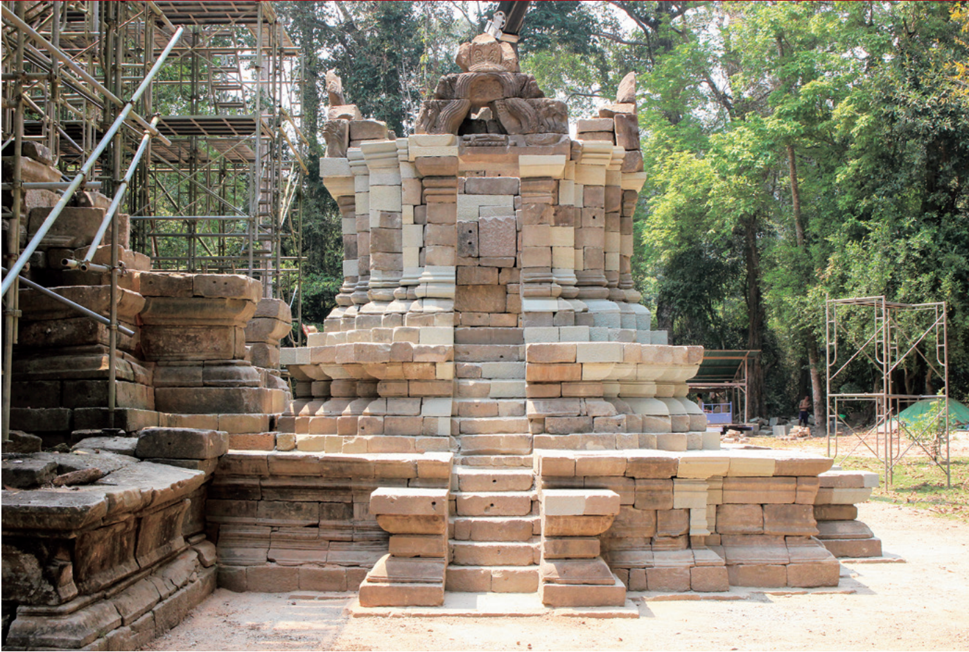
カンボジア西トップ遺跡北祠堂修復後 Northern Shrine at Western Prasat Top, Cambodia, after restoration