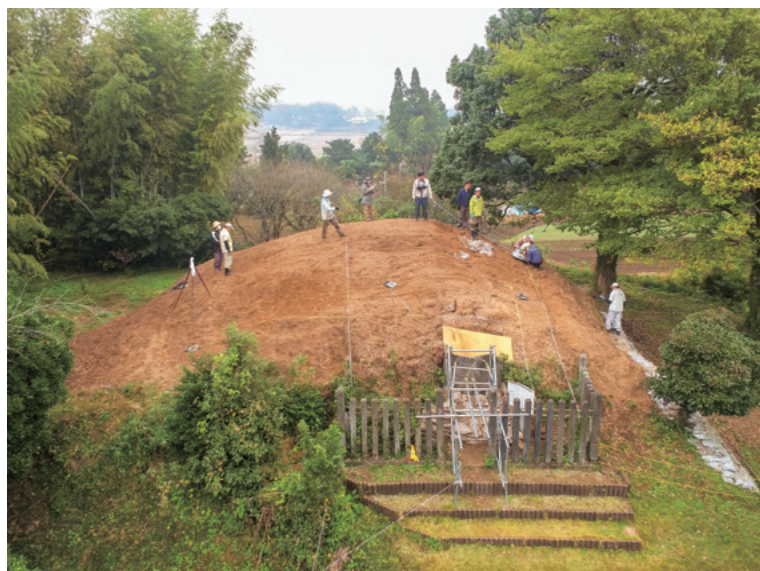
遺跡・調査技術研究室：被災古墳の探査（熊本県嘉島町井寺古墳） Archaeology Research Methodology Section: Investigation of natural disaster damage to a tomb mound (Idera Tomb in Kashima, Kumamoto prefecture)