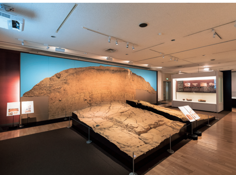
秋期特別展「高松塚古墳を掘る」の会場 Venue of the exhibit "Excavation of Takamatsuzuka tumulus"