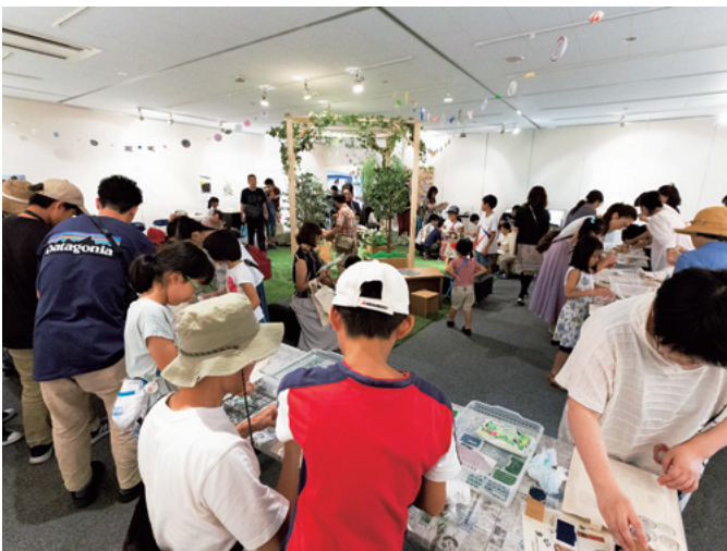
夏期企画展 ならのみやこのしよくぶつえんワークショップ Workshop in the Summer Planned Exhibit "Gardens in the Ancient Capital of Nara"