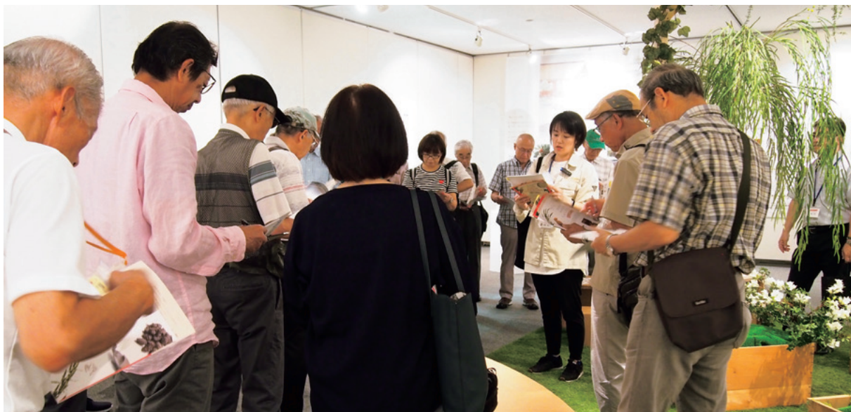
研究員によるボランティア向け展示研修 Exhibition training for volunteers by Institute staff