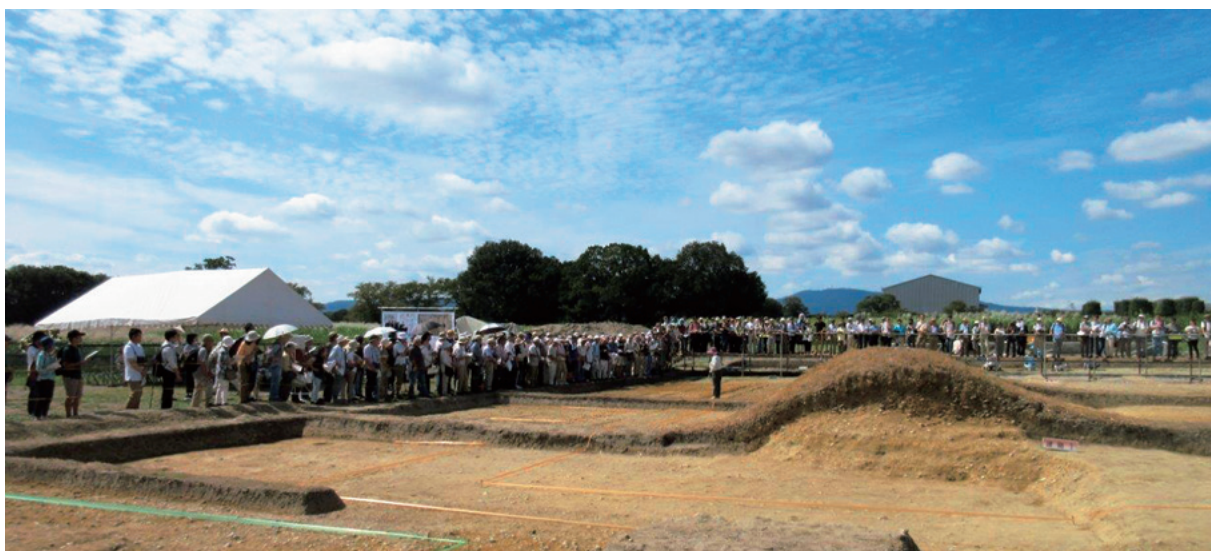
現地説明会の様子 On-site presentation