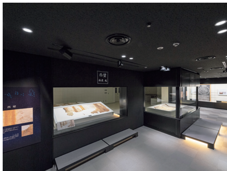
キトラ古墳壁画の公開（第13回） Public display (thirteenth) of the Kitora tomb murals