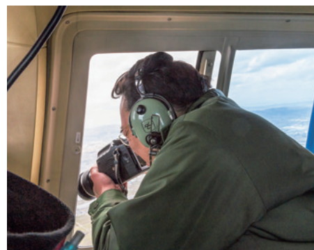
写真室：発掘現場の航空写真撮影 Photography Section: Aerial photography of an excavation