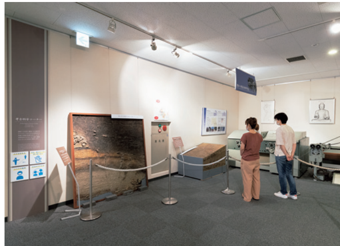
考古科学コーナー Archaeological Science Corner