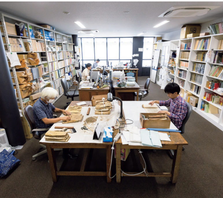
歴史研究室：研究室内での古典籍調査 Historical Document Section: Investigation of ancient documents at the Section office