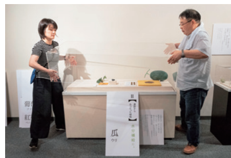
展示企画室：夏期企画展展示作業 Exhibition Section: Preparations for the Summer Planned Exhibition