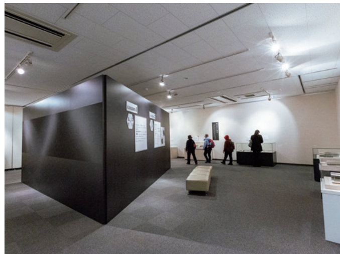
秋期特別展 地下の正倉院展一年号と木簡一 Autumn Special Exhibit "A Subterranean Treasure House: Era Names and Mokkan"