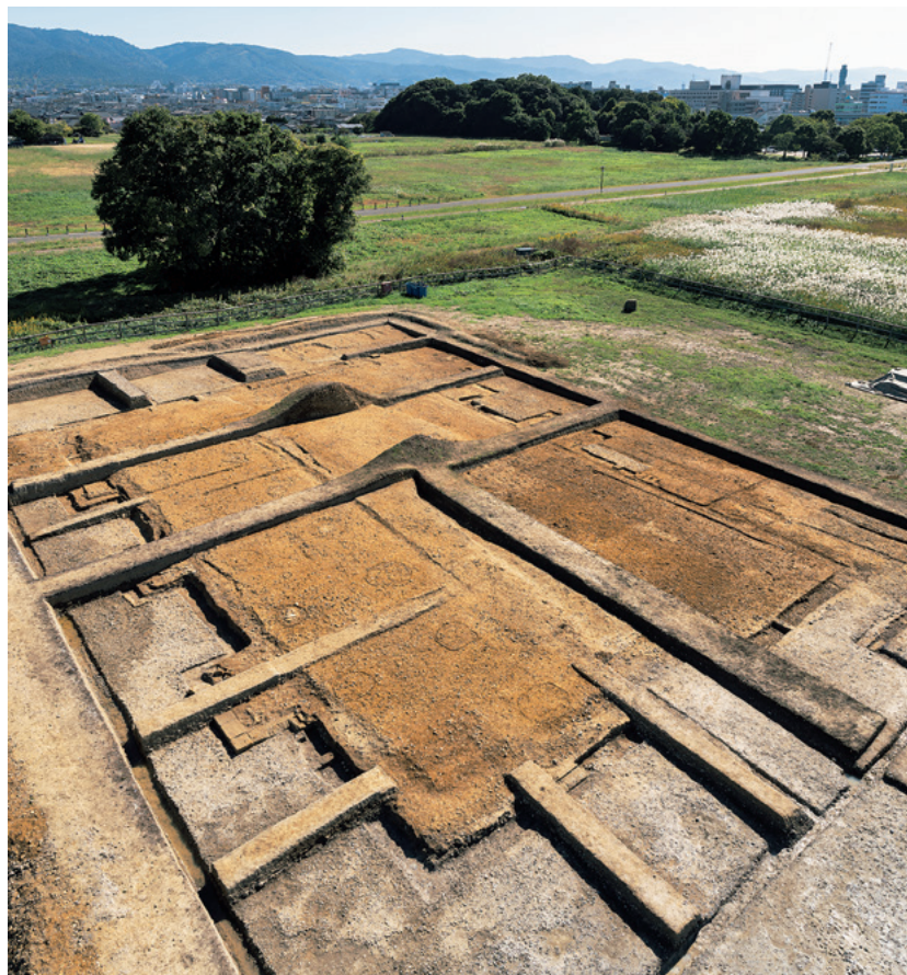
平城宮東方官衙の太政官弁官曹司の正殿とみられる大型基壇建物（北西から） Large-scale podium building thought to be the main hall of the Controller's Office, Council of State, in the eastern office sector of Nara Palace (from the northeast)