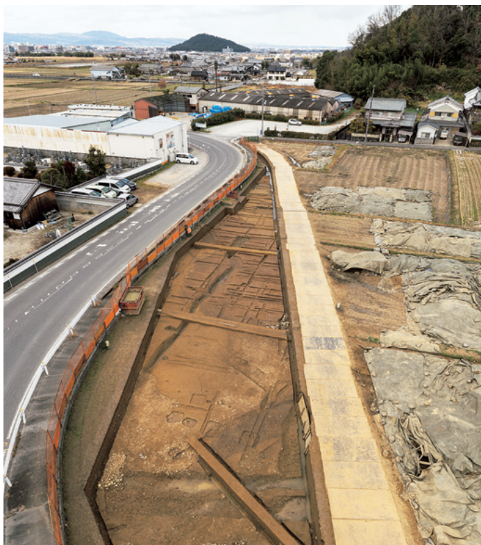
藤原京左京八条三坊東南坪の調査 古代の柱穴や斜行溝を検出した（南東から）。 Investigation in the southeastern block, East Third Ward on Eighth Street, Fujiwara Capital: Ancient period postholes and a skewed ditch were detected (from the southeast)