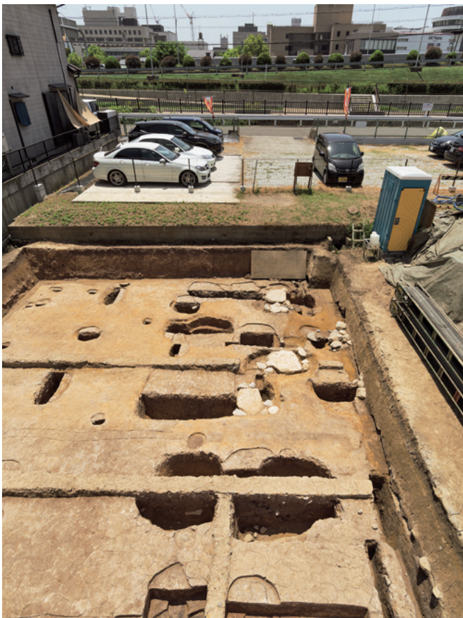
平城京左京二条二坊十一坪の重複する柱穴群（北から） Cross-cutting groups of postholes in Block 11, East Second Ward on Second Street, Nara Capital (from the north)