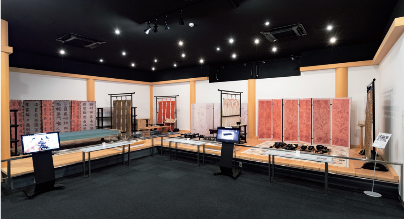
宮殿復原展示コーナー Palace Reconstruction Display Room