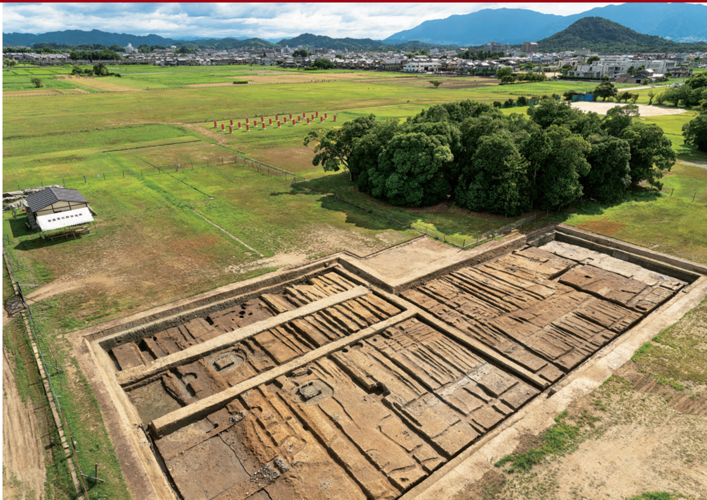
藤原宮大極殿院の調査 東面北回廊の規模と構造が判明し、大極殿後方東回廊（仮称）の存在がはっきりとなった（北東から）。 Investigation of the Imperial Audience Hall Compound, Fujiwara Palace: The scale and structure of the northern portion of the cloister's eastern side became clear, as did the existence of the Audience Hall's Eastern Rear Cloister (temporary label; seen from the northeast)