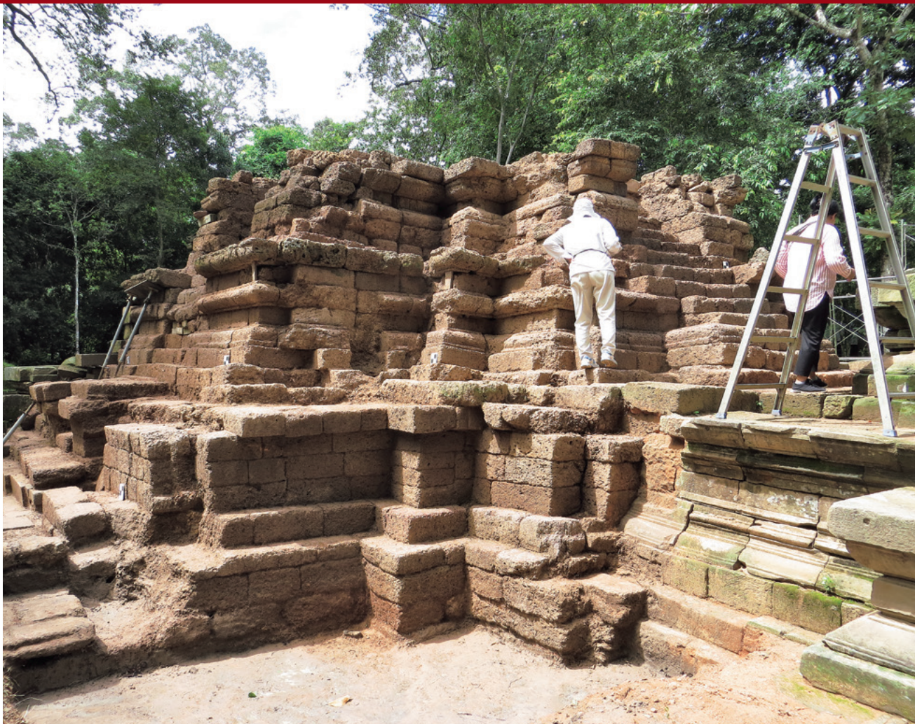
国際遺跡研究室：カンボジア・西トップ遺跡の調査修復 International Cooperation Section: Investigation and restoration at Western Prasat Top, Cambodia