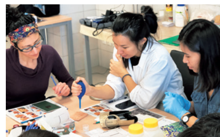
カザフスタンでの拠点交流事業の研修風景 （カザフスタン・ヌルスルタンにて） View of training conducted under a core exchange project in Kazakhstan (in Nur-Sultan, Kazakhstan)