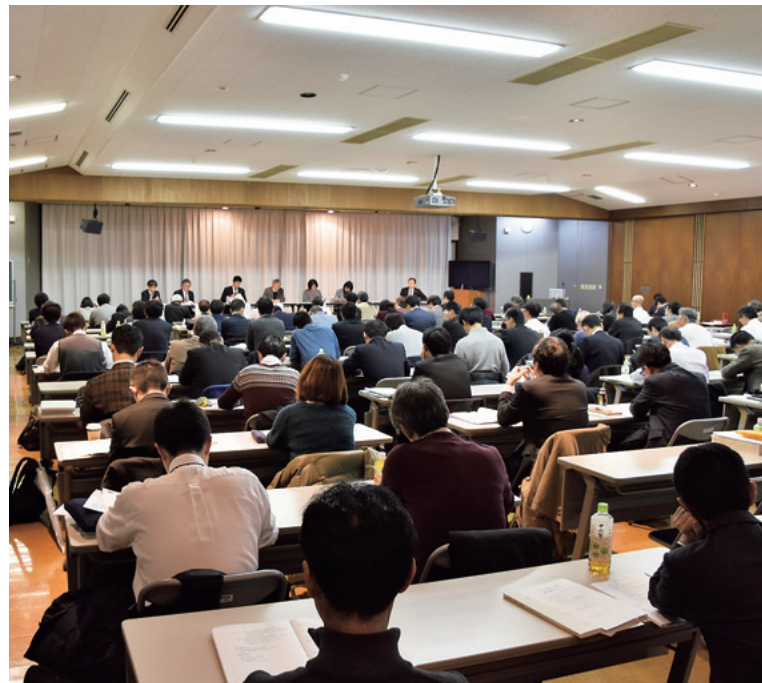
遺跡整備研究室：遺跡整備・活用研究集会 Site Management Research Section: Research Symposium on the Preservation and Utilization of Historic Sites