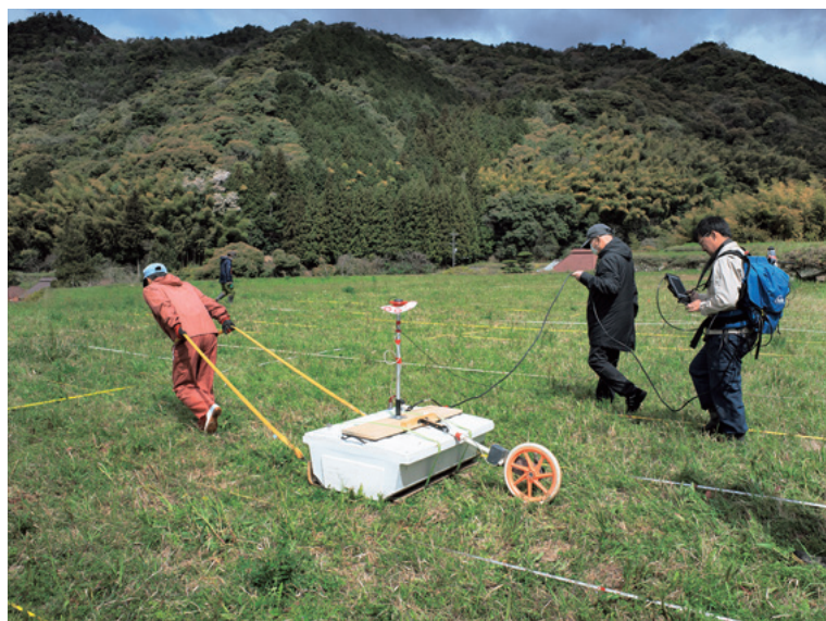
遺跡・調査技術研究室：地中レーダー探査作業風景 Archaeological Research Methodology Section: Prospection with ground-penetrating radar