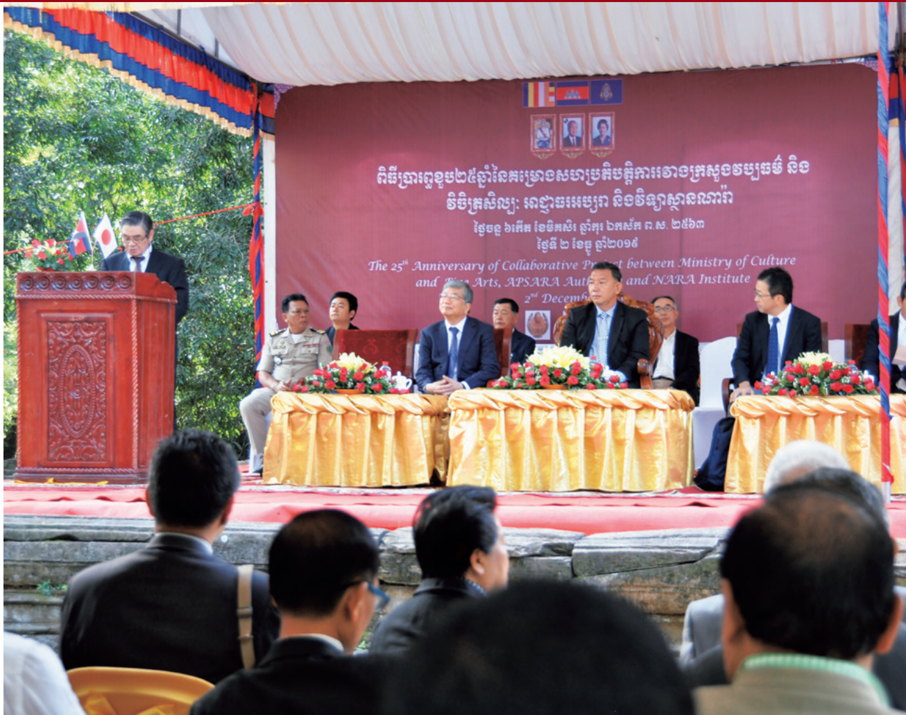
西トップ遺跡でおこなわれた奈良文化財研究所カンボジア事業25周年式典（カンボジア・シェムリアップにて） Commemoration held at Western Prasat Top of the 25th anniversary of the Institute's project in Cambodia (in Siem Reap)