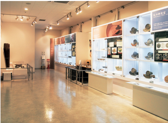
遺物展示コーナー Artifacts Display Room