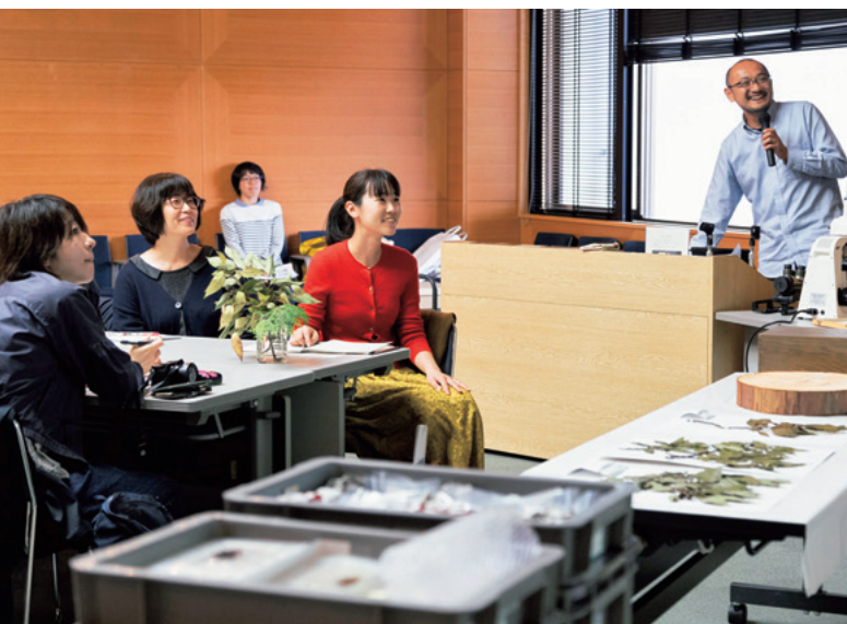
年代学研究室：飛鳥資料館特別展イベントの様子 Dendrochronological Dating Section: Scene at a special exhibit event at the Asuka Historical Museum