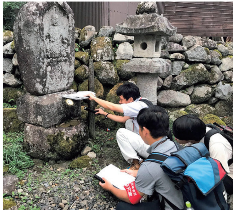
景観研究室：智頭の林業景観に関わる石造物調査 Cultural Landscape Section: Investigation of a stone monument related to the Chizu Forest Landscape