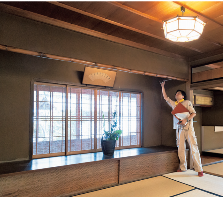
建造物研究室：高山市料亭洲さきの調査 Architectural History Section: Investigation at the traditional restaurant Susaki in Takayama City