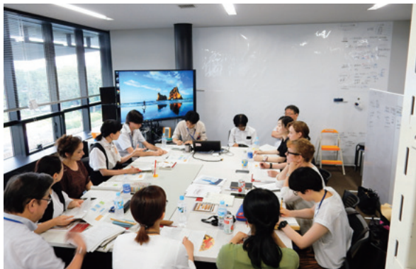
文化財情報研究室：奈文研・国立博物館の多言語化の推進 Data and Information Section: Promoting the multilingualization of the Institute and the National Museums