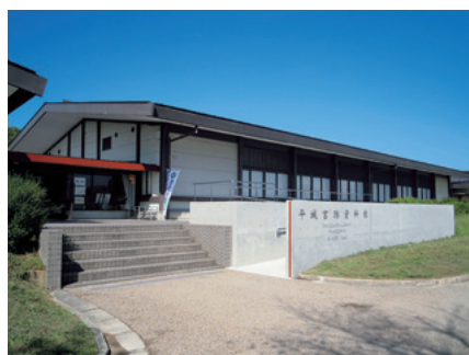
平城宮跡資料館 Nara Palace Site Museum

As planned and special exhibitions for the 2019 fiscal year, the Spring Exhibit "Takamikura: The Imperial Throne of the Nara Court," the summer children's exhibition "Gardens in the Ancient Capital of Nara," the Autumn Special Exhibit "A Subterranean Treasure House: Era Names and Mokkan ," and the Winter Planned Exhibit "Archaeology in Heijō 2019" were held. All of these were included in the national government's Beyond 2020 Program showcasing Japanese culture. Also, in January 2020 a spring mini exhibit on "Children of the Nara Capital" was held. In recent years efforts are being put into the production of these exhibits, gallery talks, and workshops for the enjoyment of those coming to the museum, resulting in an increase of returning visitors.