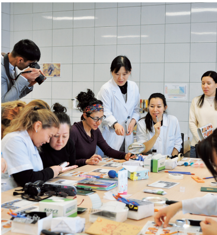
国際遺跡研究室：カザフスタンでの拠点交流事業 International Cooperation Section: Networking Core Centers Project in Kazakhstan