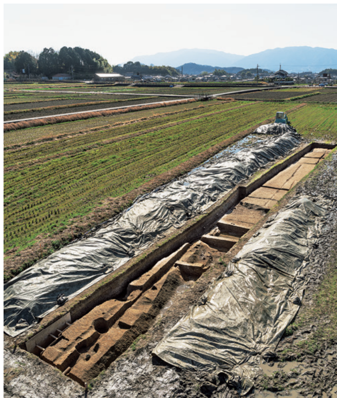
大官大寺南方の調査 古代の土坑や東西溝を検出した（北東から）。 Investigation south of Daikan Daiji temple: Ancient period pits and an east-west ditch were detected (from the northeast)