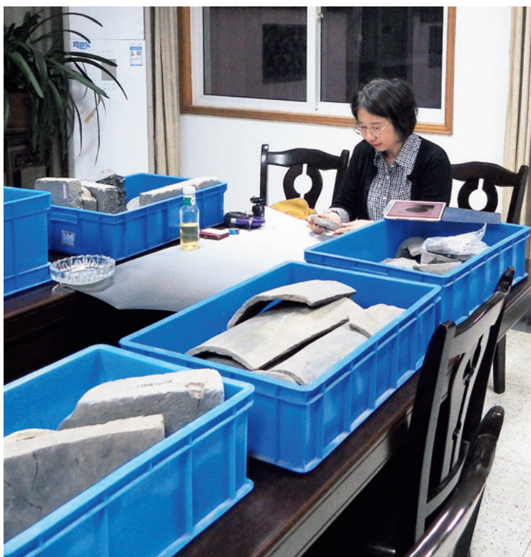
日中学術交流事業での調査風景（中国・揚州にて） View of investigation as part of a Japan-China academic exchange program (in Yangzhou, China)