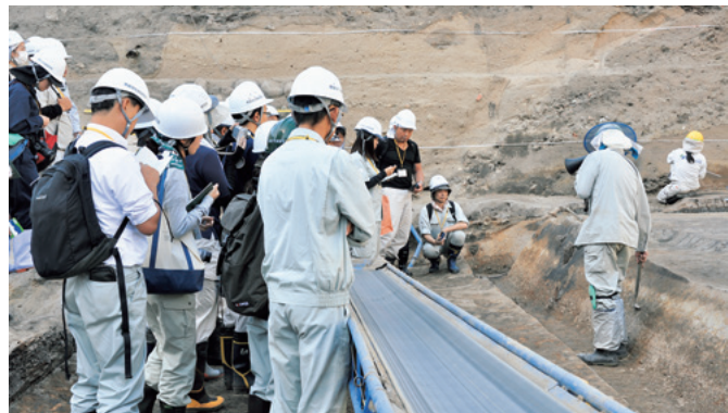
企画調整室：文化財担当者研修の企画調整 Planning and Coordination Section: Planning and coordination of training for cultural properties personnel

The Photography Section is involved in the production, management, and development of new technology for photographs related to cultural properties.