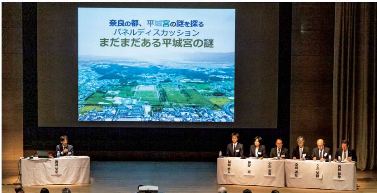
第11回東京講演会 11th Tokyo Public Lecture