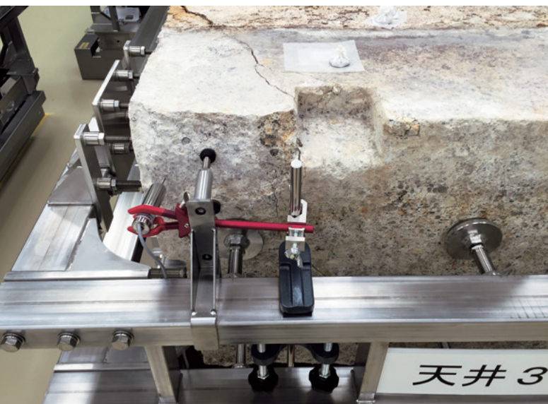
保存修復化学研究室：センサーの取付け作業 Conservation Science Section: Work on installing sensors