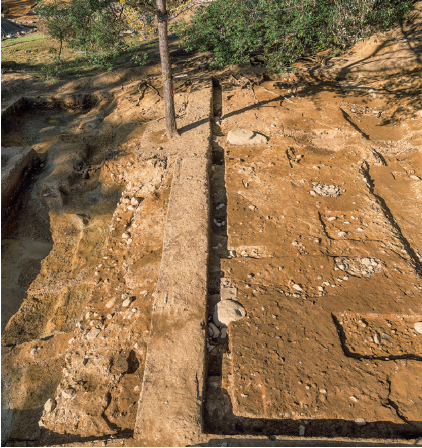
東大寺東塔院東門南半と東面回廊（南から） Southern half of the eastern gate and the eastern side of the cloister, East Pagoda Compound of Tōdaiji temple (from the south)