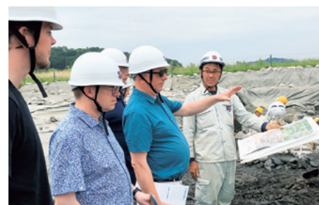
英国セインズベリー日本藝術研究所との学術交流 （奈良県高市郡明日香村にて） Academic exchange with the Sainsbury Institute for the Study of Japanese Arts and Cultures (in Asuka Village, Takaichi District, Nara)