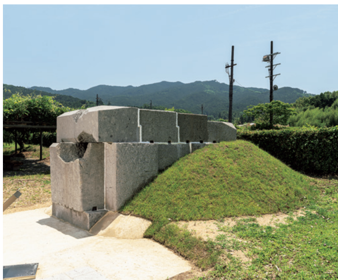
高松塚古墳 解体実験用石室 Stone chamber replica of the Takamatsuzuka tomb for experimental dismantling