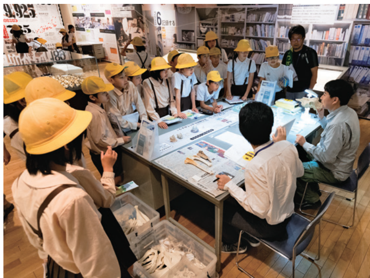
環境考古学研究室：研究員を展示するイベント Environmental Archaeology Section: An event exhibiting the researchers