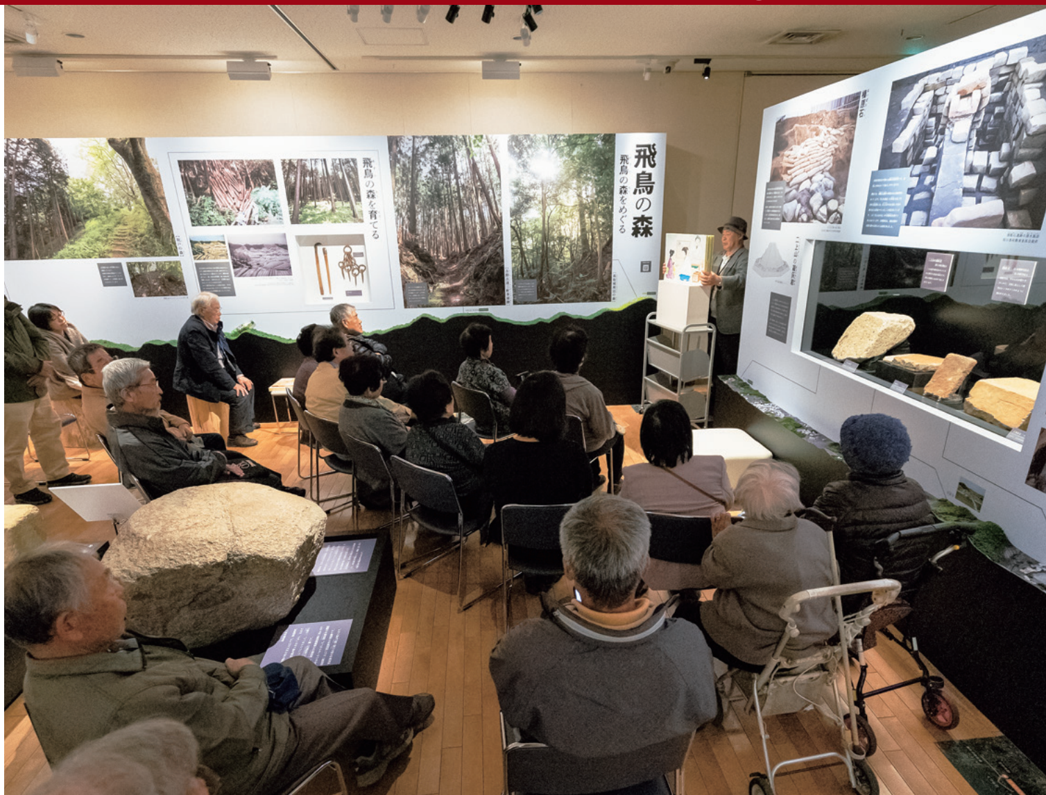
秋期特別展『飛鳥—自然と人—』イベント「ふるさと飛鳥を語る」会場風景 Scene at the event "Talking about Our Home, Asuka" at the Autumn Special Exhibit "Asuka: In Harmony with Nature"