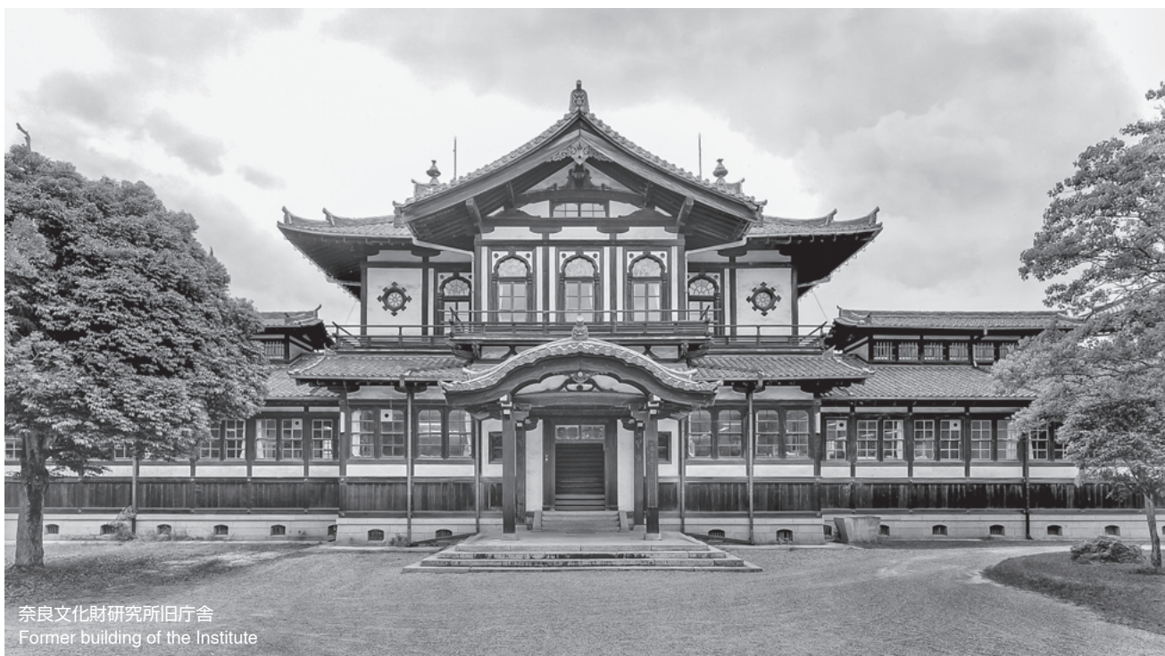
奈良文化財研究所旧庁舎 Former building of the Institute

As part of the Japanese Government's reform initiatives, national research institutes belonging to government ministries and agencies are undergoing reorganization. Consequently, the National Research Institute for Cultural Properties, Tokyo, and the Nara National Cultural Properties Research Institute were integrated and reorganized as branches of the Independent Administrative Institution in April 2001. Further, in April 2007, the Nara National Research Institute for Cultural Properties became one unit of the Independent Administrative Institution National Institute for Cultural Heritage, created through a merger with the Independent Administrative Institution, National Museums.