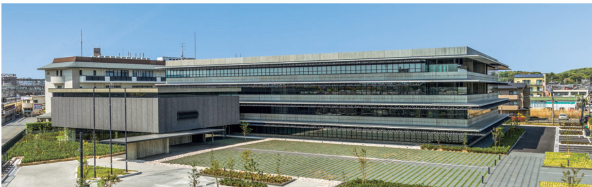
本庁舎の外観（2018年3月完成） Exterior view of the office building (completed March 2018)

At present, the Department conducts the spring and autumn public lectures for broadcasting the results of the Institute's investigations and research, the Tokyo lecture, the publication of those research results and the dissemination of information through the Institute's website, and the management etc. of the volunteers who provide explanations at the Imperial Audience Hall, Suzaku Gate, East Palace Garden, and the Nara Palace Site Museum of the Special Historic Site Nara Palace. Also, the Department bears the burden entrusted by the Agency for Cultural Affairs of maintaining the historic environment and facilities within the Nara Palace and Fujiwara Palace Sites, and administering the Agency for Cultural Affairs Kitora Tomb Murals Preservation and Management Facility set up within the Kitora Area of the Asuka Historical National Government Park.