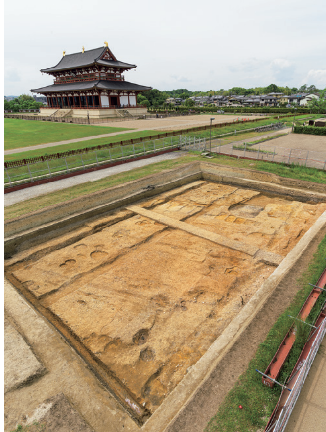
平城宮第一次大極殿院東辺の平城太上天皇期の外郭塀と南北溝（南東から） Outer palace wall and north-south ditch from the time of Retired Emperor Heizei, east of the Former Imperial Audience Hall Compound (from the southeast)